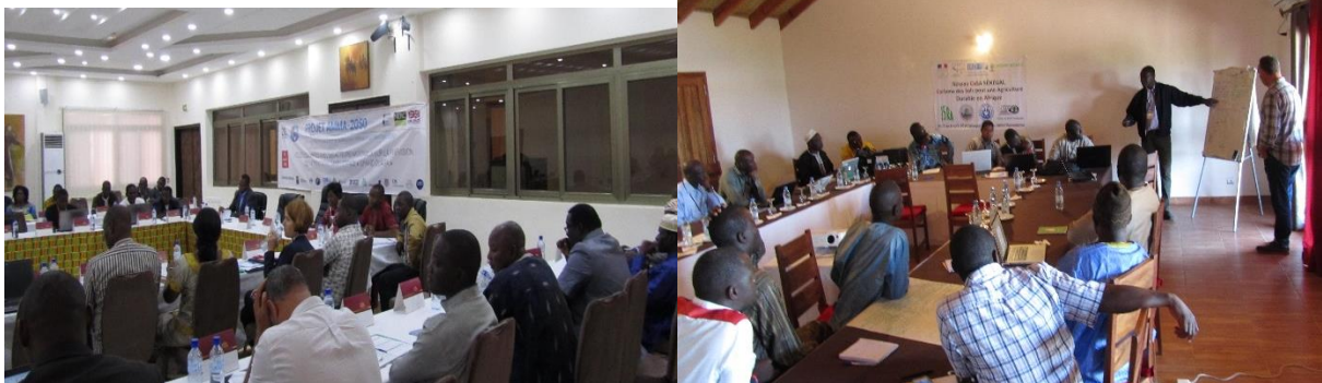
Stakeholder workshop: Burkina Faso (July 2016) & Senegal (April 2016)